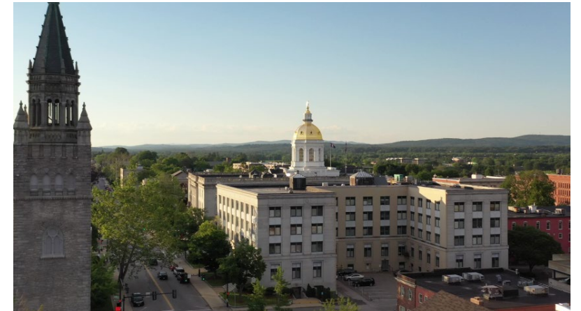
The Photo by PhotoAuthor is licensed under CCYUSA.